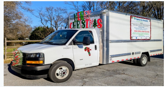
Inwood & Charles Town Parades