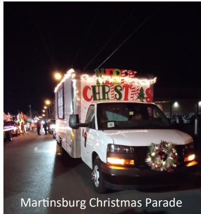
Martinsburg Christmas Parade

MISSION: Seeking to put God's love into action, Habitat for Humanity brings people together to build homes, communities