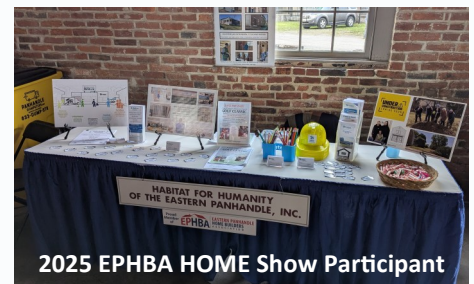
2025 EPHBA HOME Show Participant